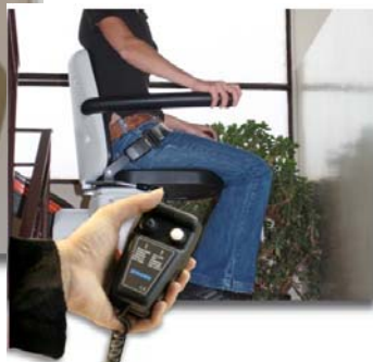
Extensible push-button panel