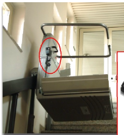
Extensible control panel